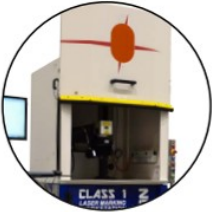
Pneumatic door operation

Telesis ProStations provide a modular way to safely mark components within an enclosure engineered to CDHR Class 1 and ISO13849-1 guidelines.