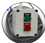
Start/Abort Control Unit