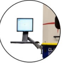
Adjustable ergonomic computer monitor, mouse and keyboard arm