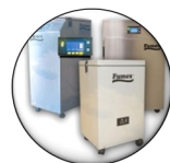
Fume Removal Systems