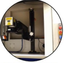
Manual and Programmable-Z axis adjustment